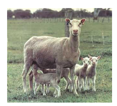
Finn ewe with quadruplets.

The Finn is a white fat tailed breed. The head is polled, the face free from wool and it should have white feet. The wool is even, soft and lustrous. It is a white wool with good even staple length and lock. The crimp is well defined and even from staple base to tip. Micron range 20 – 26um.