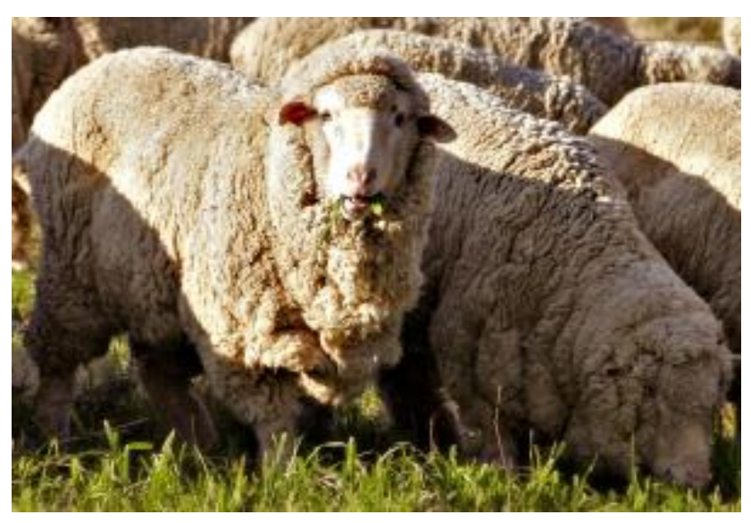
Merino sheep in full wool. Lismore. Victoria. Australia.

The predominant breed of sheep in Australia is the Merino. The Merino was first introduced into Australia in 1797 and has over the years developed for wool production. It has also been used for cross breeding with British Long Wool & Short Wool Breeds for mutton and prime lamb production.