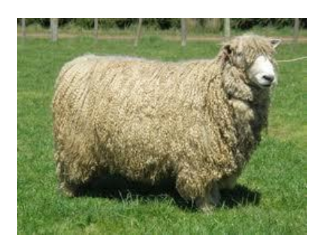
English Leicester sheep.

The English Leicester has a large frame and is a hornless sheep with black feet. The English Leicester has lustrous wool with a staple length of 200 - 250 mm. The wool has a fibre diameter from 32 - 35 microns.