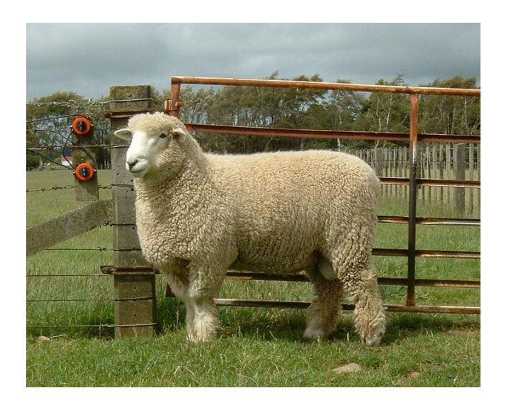
Romney Marsh Ram.

The Romney Marsh is a large-framed, hornless sheep. It has a thick top knot a white face and kemp fibres on its face and legs. The Romney Marsh produces demi-lustrous wool of 75 - 200 mm staple length and 30 - 34 microns fibre diameter. Romney marsh ewes are excellent mother and when crossed with British Short wool breeds, produce high quality lamb.