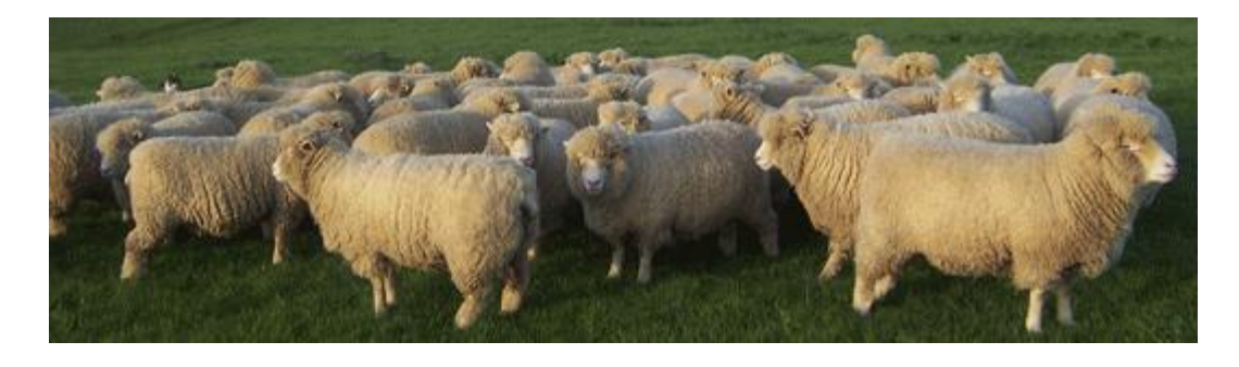
Poll Dorset ewes

Poll Dorsets and Dorset Horns are renowned as prime lamb sires and are usually mated to crossbred (Merino cross), British Long Wool or Merino ewes.