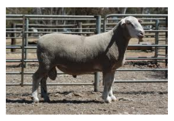
White Suffolk Ram (Ida Vale Stud W.A)