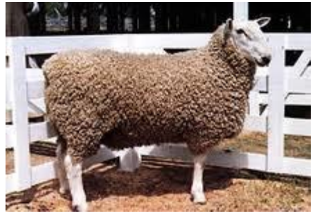
Border Leicester sheep.

The Border Leicester is a large framed hornless sheep. It has lustrous wool of 175 - 225 mm staple length and a fibre diameter of 32 - 34 micron. The Border Leicester is a popular breed for producing first cross (Merino ewe x Border Leicester ram) ewes. The first cross ewes are prolific at producing twins are good milkers and their lambs mature quickly for the meat market.